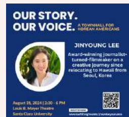
Korean American Community Foundation

“ Songs of Love brings to life the triumphs and hardships of our ancestors, reminding us that our journey is only just beginning... ”