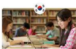
영화를 통해 한인 이민 역사를 만나고 소중한 삶의 가치를 재확인해요