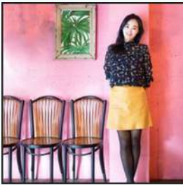
Hyundai Card Travel Library