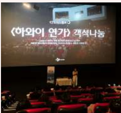
Big Star Institute & Community Chest of Korea