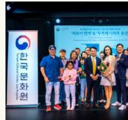
Korean Cultural Center Los Angeles