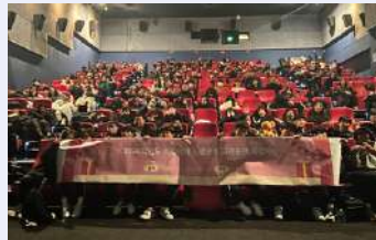
Seonil Middle School