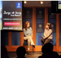
The Korea Society