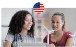
Understanding Korean American Narratives through Cinema