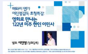
Seoul National University Asia Center

“ A must-watch for anyone studying the Korean diaspora. ”