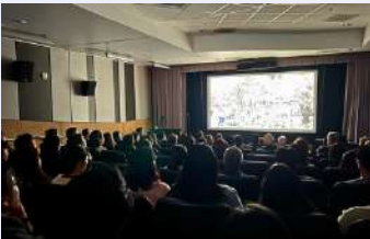
UC Irvine Center for Korean Studies