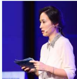
Ministry of Foreign Affairs