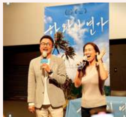
Now Production Films & CJ Welfare Foundation