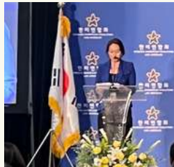
Korean American Coalition