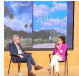
Georgia State University