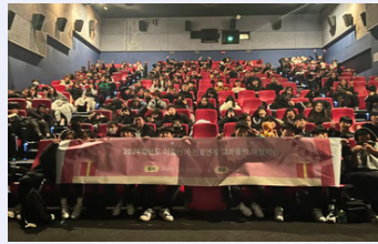
Seonil Middle School