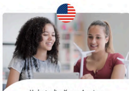
Understanding Korean American Narratives through Cinema