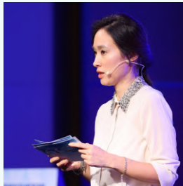
Ministry of Foreign Affairs