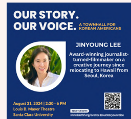
Korean American Community Foundation

“ Songs of Love brings to life the triumphs and hardships of our ancestors, reminding us that our journey is only just beginning... ”