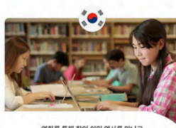
영화를 통해 한인 이민 역사를 만나고 소중한 삶의 가치를 배워 봐요