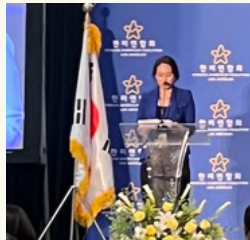
Korean American Coalition