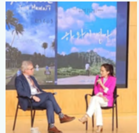
Georgia State University