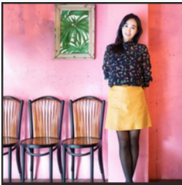
Hyundai Card Travel Library