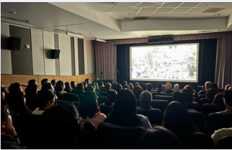
UC Irvine Center for Korean Studies