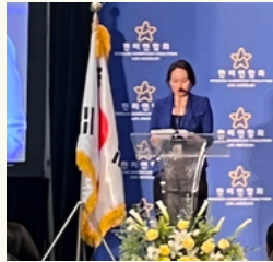
Korean American Coalition