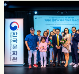
Korean Cultural Center Los Angeles