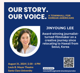
Korean American Community Foundation

“ Songs of Love brings to life the triumphs and hardships of our ancestors, reminding us that our journey is only just beginning... ”