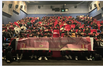
Seonil Middle School