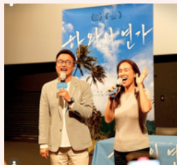
Now Production Films & CJ Welfare Foundation