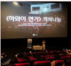
Big Star Institute & Community Chest of Korea