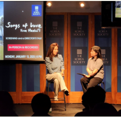
The Korea Society