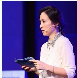
Ministry of Foreign Affairs