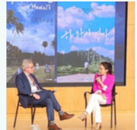
Georgia State University